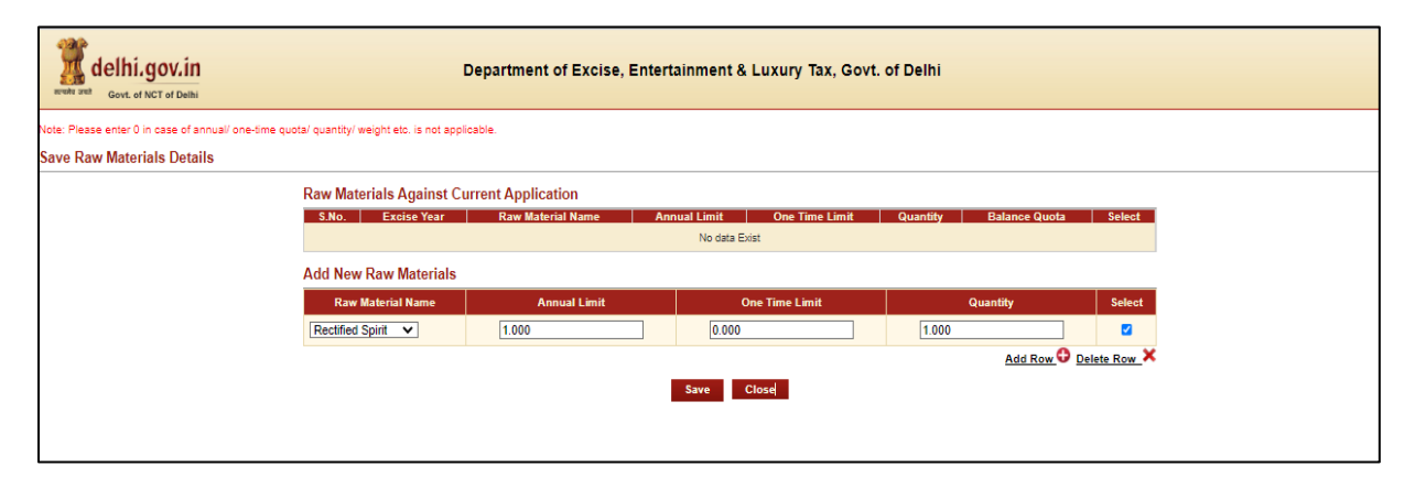
<u>Step 7:- Now click on link present below "Fill Raw Materials Details" after filling the form Save the</u> <u>Raw Material Detail & Close the form</u>